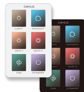
Coloured Vertical Switchplate Film Covers (Sold Separately)