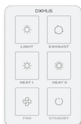
White Wall Controller (Included)