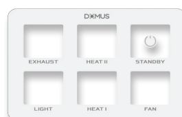
Horizontal Switchplate Film Cover (Included)